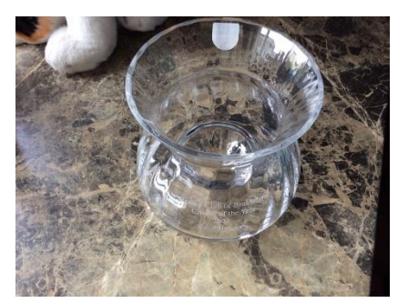
The Certificate and Dartington Rose Bowl Award