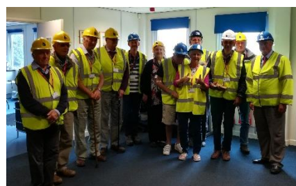
A Very Motley Crew

Club members were treated to a very informative visit to the shipyard, where staff gave a presentation on the history and workings of the facility, followed by a tour of the new Irish Navy patrol boat the "George Bernard Shaw"