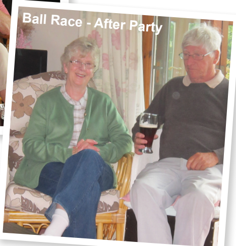
Ball Race - After Party