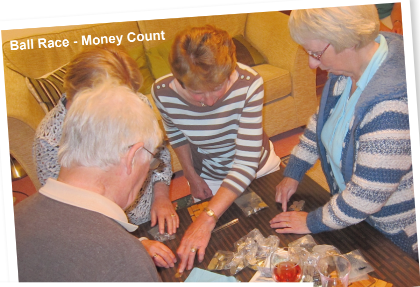
Ball Race - Money Count