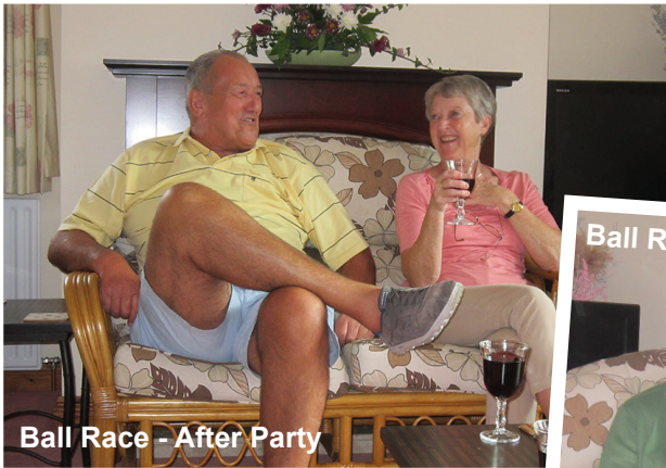
Ball Race - After Party